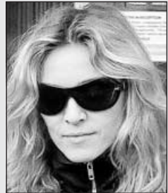
STAR MUM ... Madonna